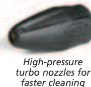
High-pressure turbo nozzles for faster cleaning

Telescoping wands extend to 24' to reach high places without scaffolding