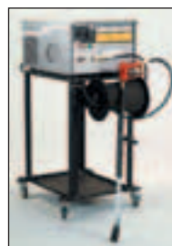
Optional Hose Reel Kit, Cart, Caster Wheel Kit and stainless steel base and cover