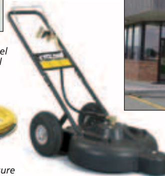
Rotary surface cleaner attaches to your pressure washer; reduces overspray and zebra striping