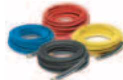
Heavy-duty, high-pressure hoses in lengths up to 150-ft.