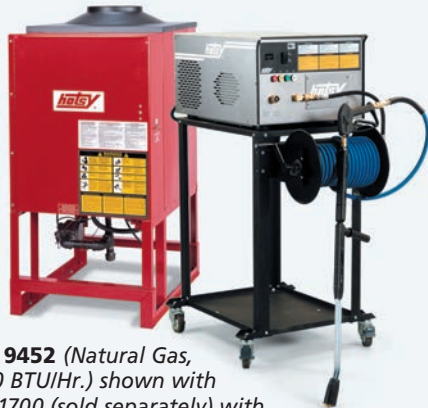
Model 9452 (Natural Gas, 540,000 BTU/Hr.) shown with Model 1700 (sold separately) with optional hose reel, cart, caster wheel kit and stainless steel base & cover

All models operate on 115V and are ETL safety certified. Gas-fired models feature electronic ignition. They are designed to attach to cold water pressure washers with cleaning power of 6 to 10 GPM and up to 3200 PSI. We recommend using the Hotsy 1700 Series stationary cold-water pressure washers.