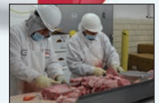
Food processing applications