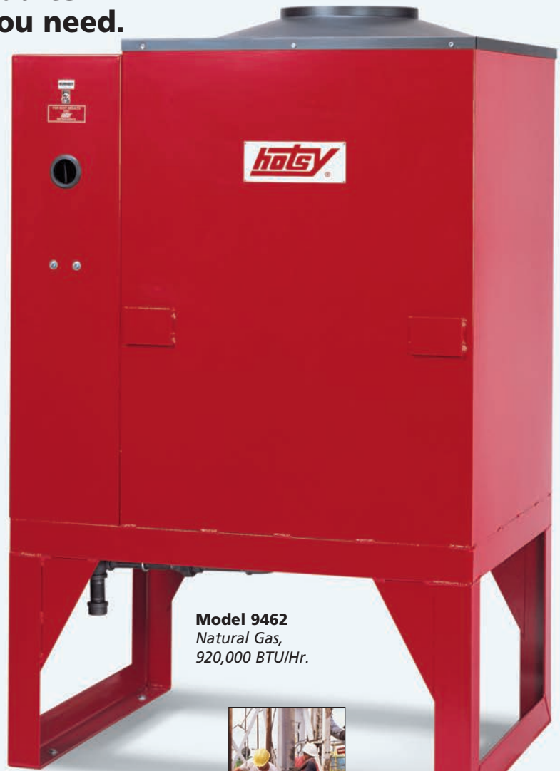
Model 9462 Natural Gas, 920,000 BTU/Hr.